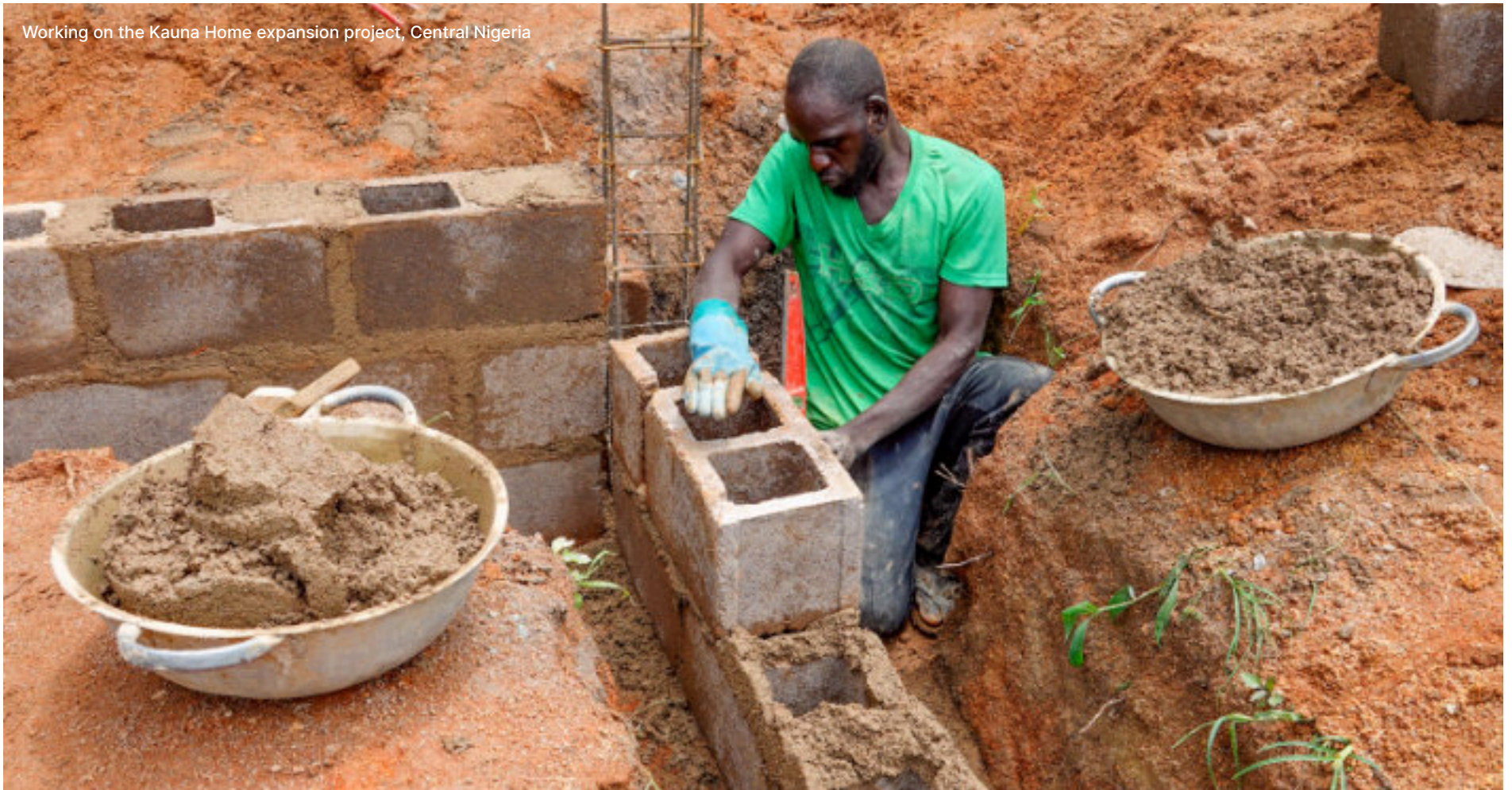
Working on the Kauna Home expansion project, Central Nigeria

days and provides teaching, food, medical care and supplies to take home for hundreds of women in need. These one-day Christmas events bring hope and joy to the hurting. One of these events was attended by over 800 widows this year.