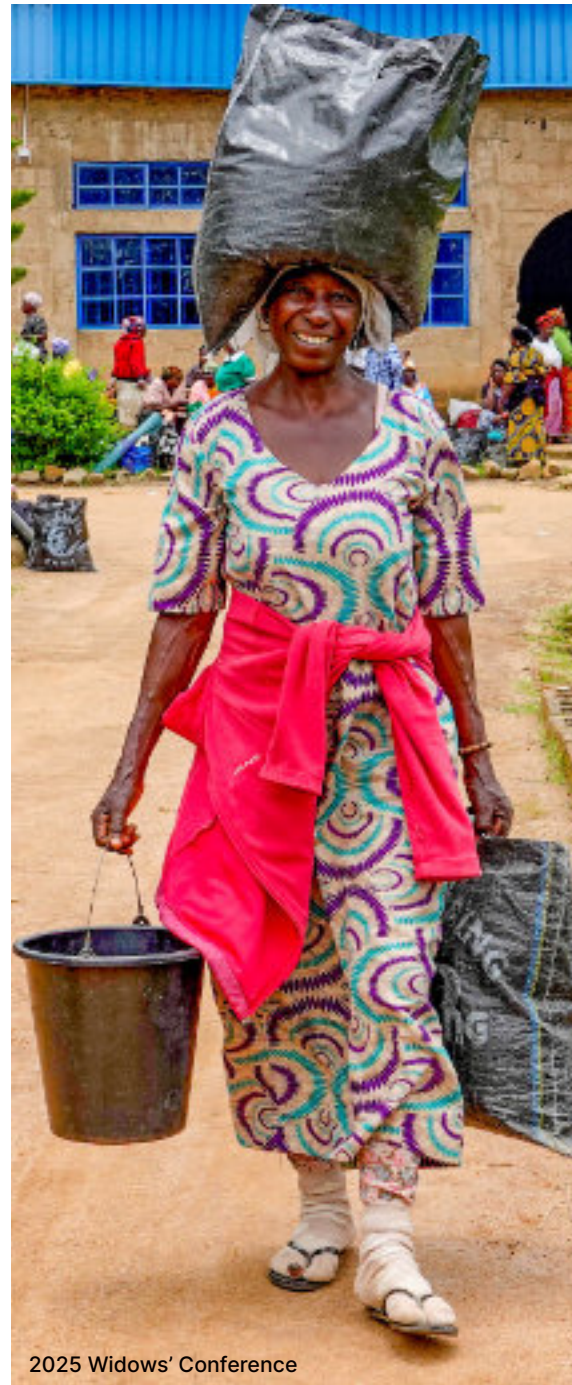
2025 Widows' Conference

MAY AMEN has always been a missionary training and sending organization. In May we were able to help them refurbish some of their facilities and also to provide training tools. Part of missionary training with AMEN involves developing skills that can help provide the missionary an income and/or