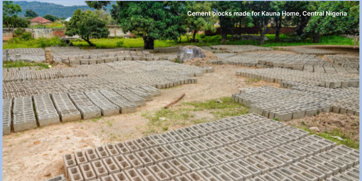
Cement blocks made for Kauna Home, Central Nigeria

We believe that providing good food from wisely managed farms will be blessed by God. Nigeria is not currently able to feed its people. It is plagued not only with violent attacks on farming communities, but by poor farming practices that do not sustain the soil. Our hope is that the Kwali farm and training center will