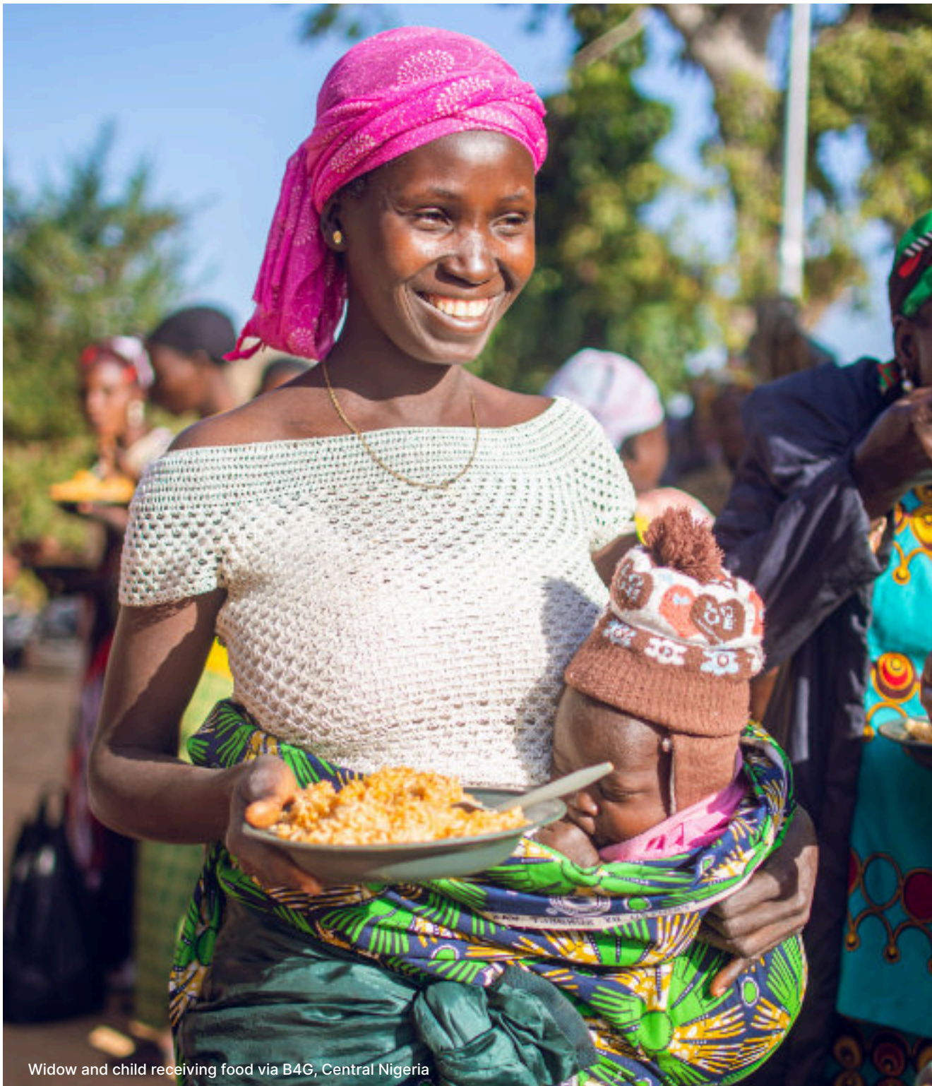
Widow and child receiving food via B4G, Central Nigeria

STM mission and that we believe we can find donors to support.