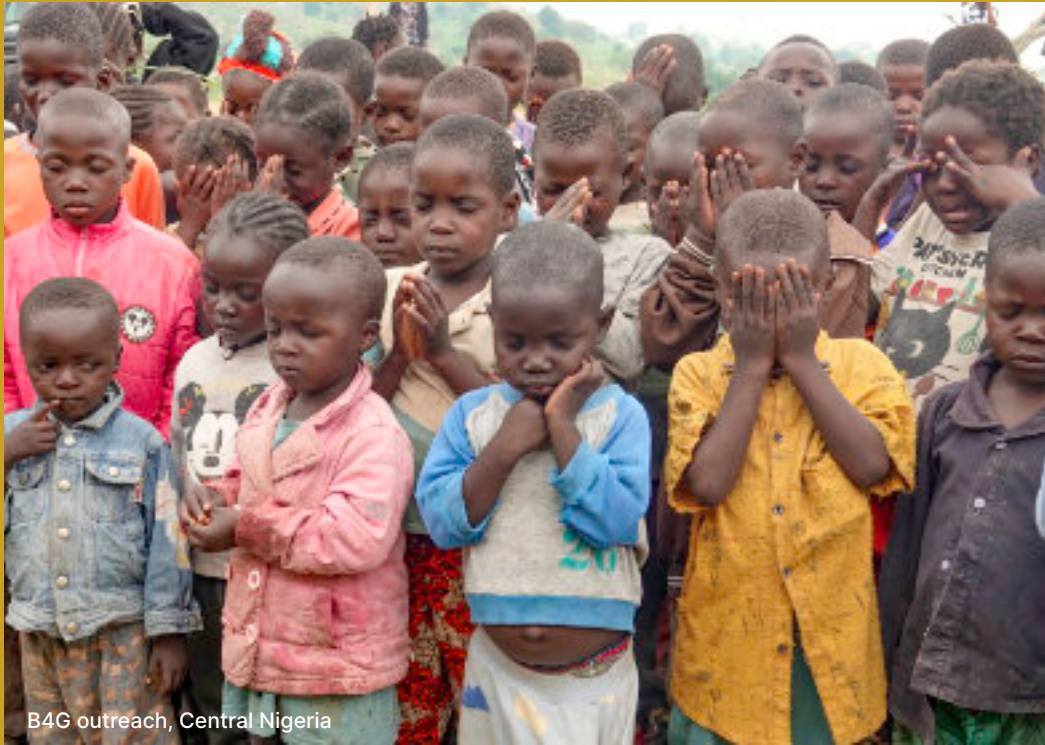
B4G outreach, Central Nigeria