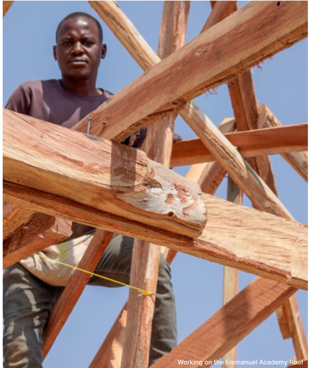
Working on the Emmanuel Academy Roof