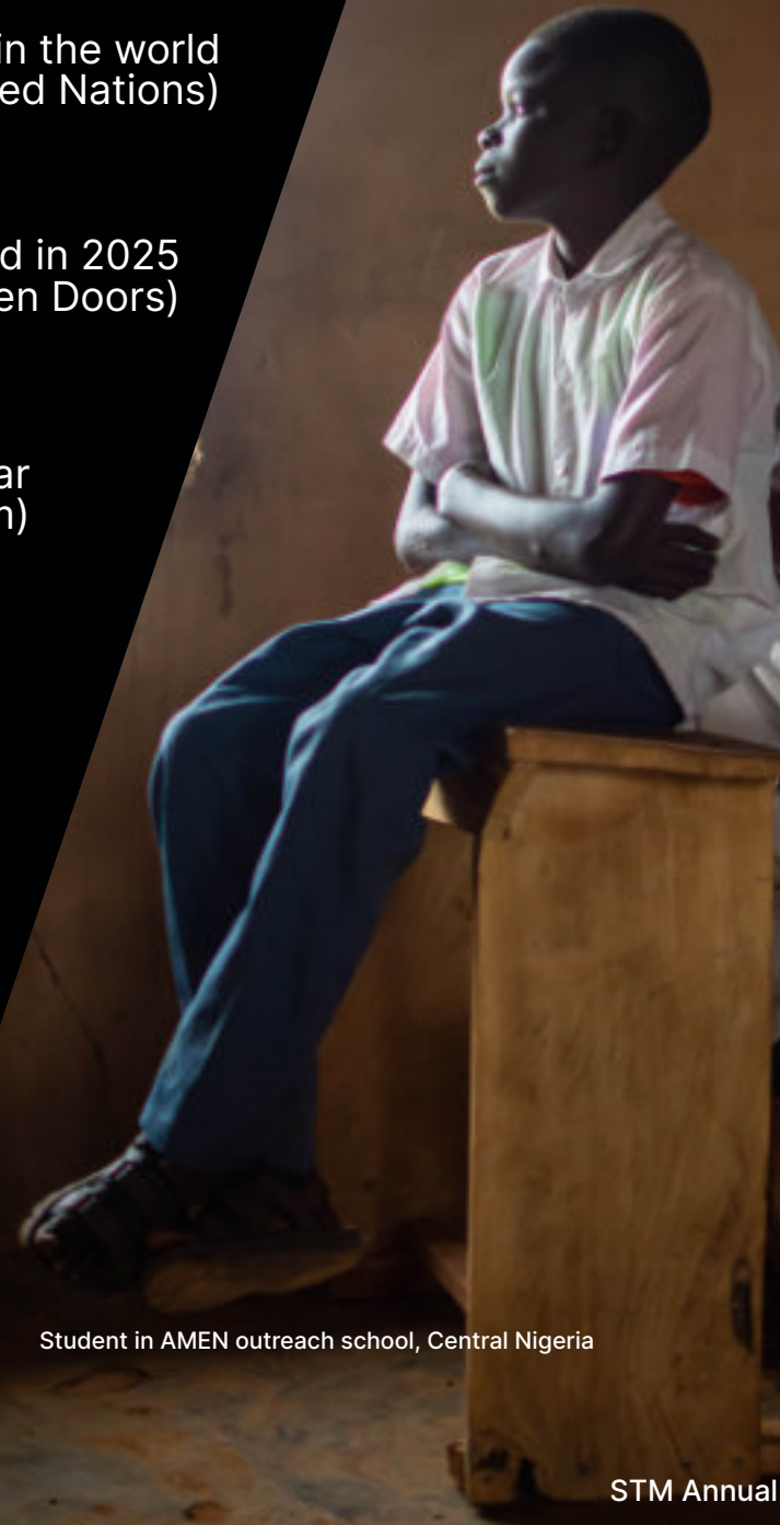
Student in AMEN outreach school, Central Nigeria

The problems are enormous, but we have been given unique opportunities to help specific communities in tangible and effective ways. With your help, the hope of Christ can be extended to and through our brothers and sisters in Nigeria and West Africa.